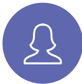
Executive Sponsor (Part Time)

ERP is by nature a broad-based user tool. Your project team should have adequate representation from all areas of the business – engineering, materials, production, finance, customer service, etc. in addition to IT. Users must be involved right from the start and should lead the effort in selecting the system and planning/carrying out the implementation. That is the only way to build the sense of ownership that is essential for widespread acceptance and project success.