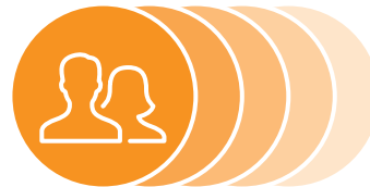
User Community Task Teams (IT, Finance, Engineering, Production, Materials, Service, etc.)

The project will also need an executive sponsor to provide vision, motivation, and conflict resolution (when the team doesn't have the authority to break a stalemate or resource contention issue). Project team participation is seldom a full-time job (except perhaps for the project leader/team leader). Specific tasks will be completed by sub-teams in the individual departments under the watchful eye of task team leaders who report to the project team.